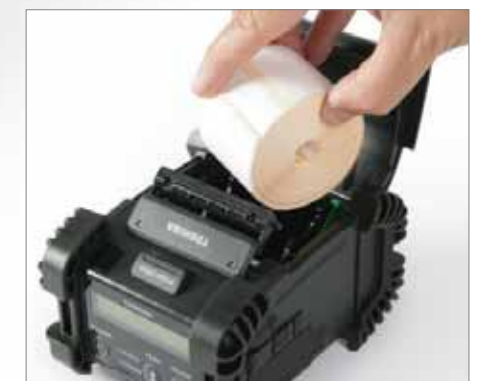
Market-leading media capacity for fewer roll changes