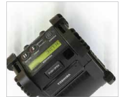
Robust and rugged, withstands a 1.8m drop on to concrete (1.5m for B-EP4)