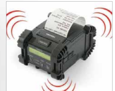
Wi-Fi certified (GH40 model)