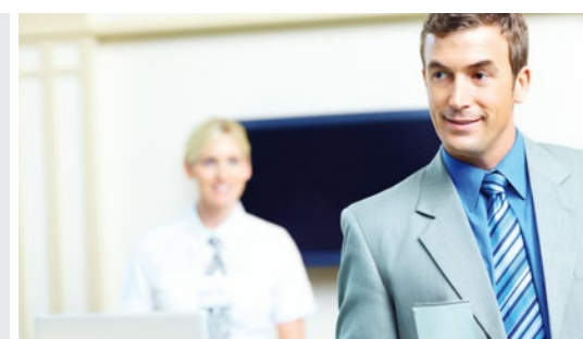
* Future options

The Windows® 7-ready WILLPOS C10 is available with a full range of options, including customer display and MSR. A number of communication devices and expandable COM ports* ensure the system is future-proofed and flexible.