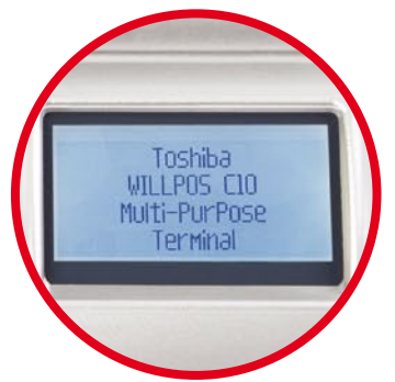
In-built customer display

Rugged and reliable, the WILLPOS C10 is designed for the widest range of applications and environments - a truly multi-purpose solution with stylish aesthetics, fan-less operation and the smallest of footprints.