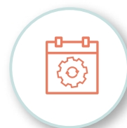
Fewer Routine Service Calls