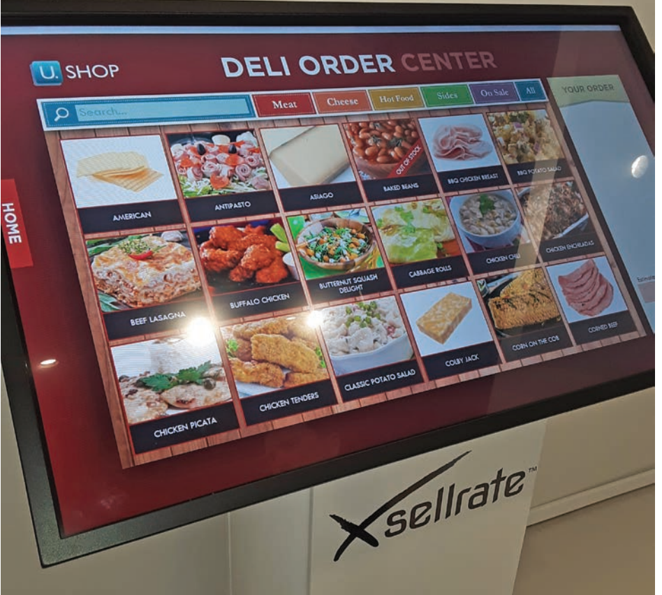
Toshiba digital signage for use in food service

"We're proud to be an Orange County company," said Toshiba's Maccabe, who grew up in Southern California. "We're very proud of that"