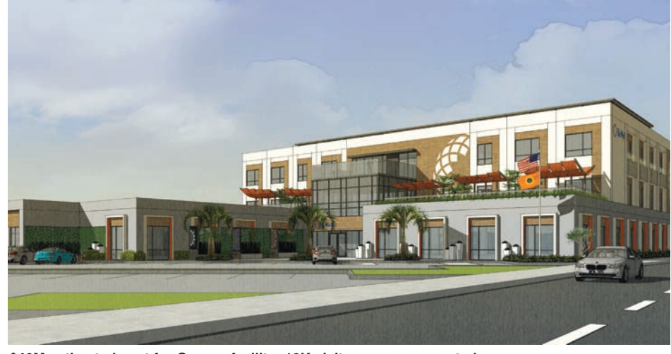
$40M estimated cost for Orange facility; 10K visits per year expected

The estimated $40 million cost of the initial project is largely being funded by three groups: CalOptima , the community-based