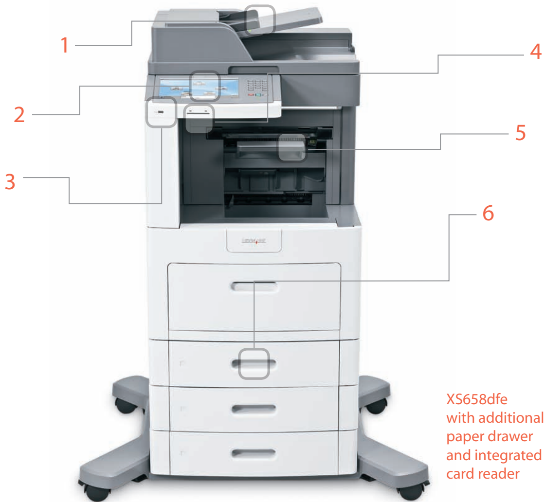
XS658dfe with additional paper drawer and integrated card reader