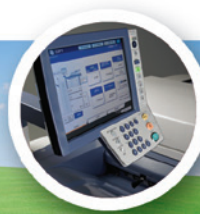
10.4" super VGA control panel