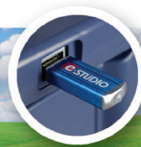
USB direct print from & scan to