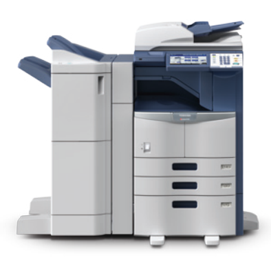
e-STUDIO456 with 2,000-Sheet LCF, Hole Punch, and 50-Sheet Staple Console Finisher.