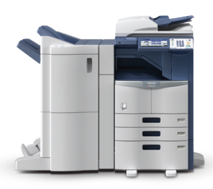
e-STUDIO456 with 2,000-Sheet LCF, Hole Punch, and Saddle-Stitch Finisher.